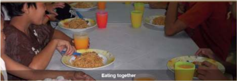
A meal provided by Jigsaw Ministries