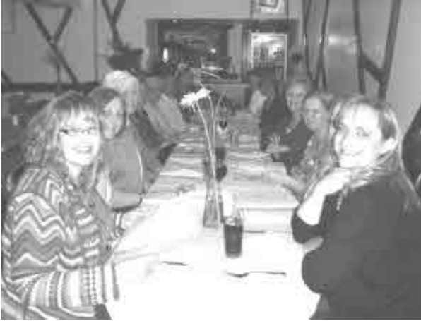
The Ladies' Curry Night.